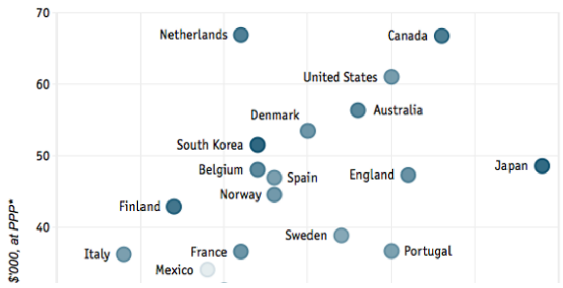
Do shorter hours or higher wages make better teachers?

High-school teachers' salary and working hours, 2013