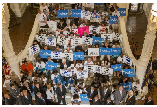
Demonstrators from Erie, Pa., rallying at the Pennsylvania Capitol in Harrisburg last month to press for more state aid for district schools.

Long-term returns for U.S. public pensions are expected to drop to the lowest levels ever recorded