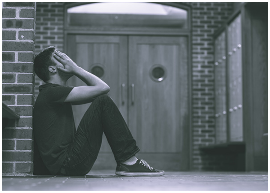
What helicopter parenting hath wrought.