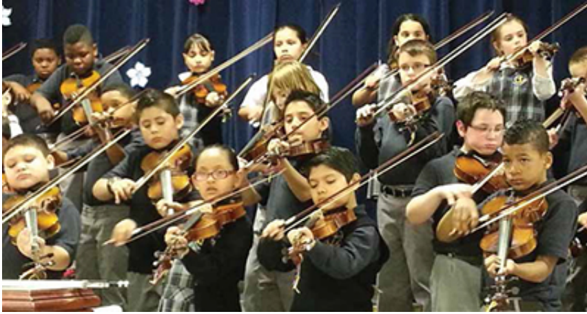
Blackstone Valley Prep Mayoral Academy 3rd-grade strings program, 2013.